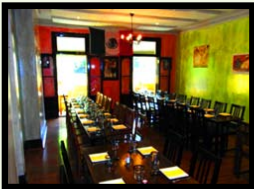
Function Room 55 persons Max - 60 with balcony