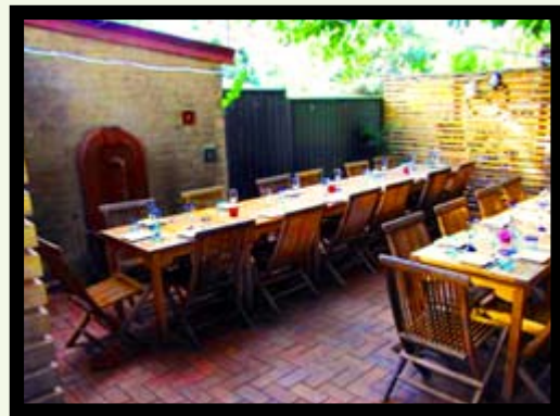
Outdoor Courtyard 30 persons Max.